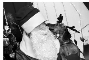
Pet Pictures with Santa